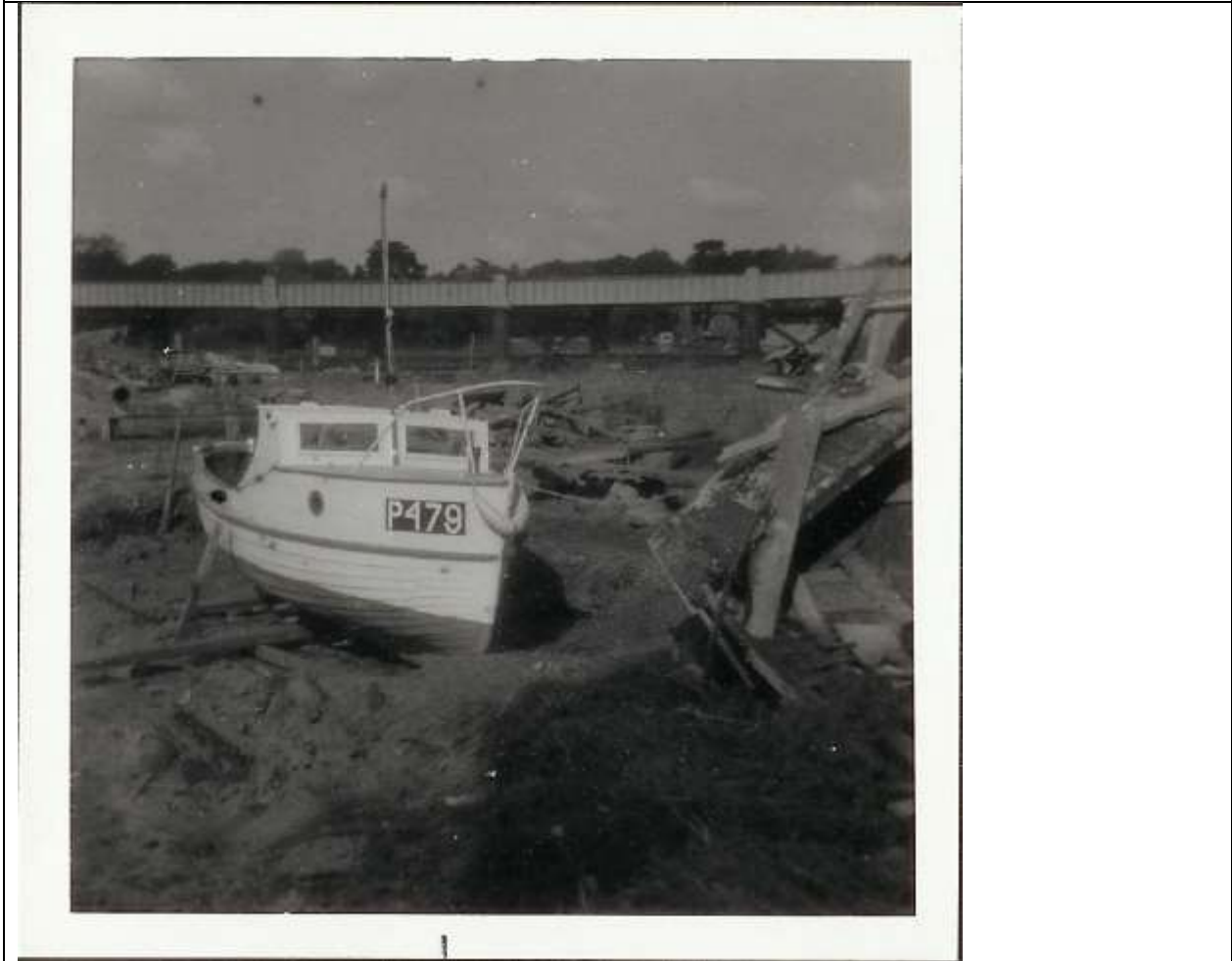
Site in late 1970's or early 1980's at low tide