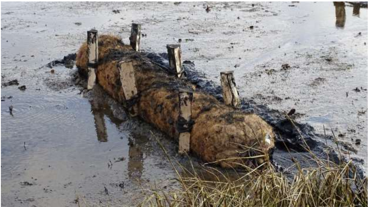
Figure 2. Newly installed coir role to encourage sedimentation and saltmarsh colonisation

Lessons could be learned from the successes and failures of the restoration efforts which would be written up and given to the Hamble Harbour Authority so future efforts would improve the chances of saltmarsh restoration success elsewhere in the estuary.