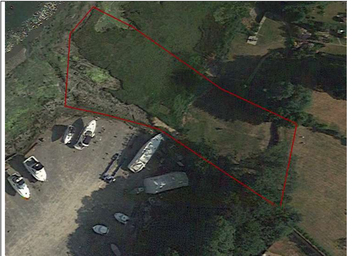
2018: Area of hardstanding visible covering an area of approximately 23 m 2