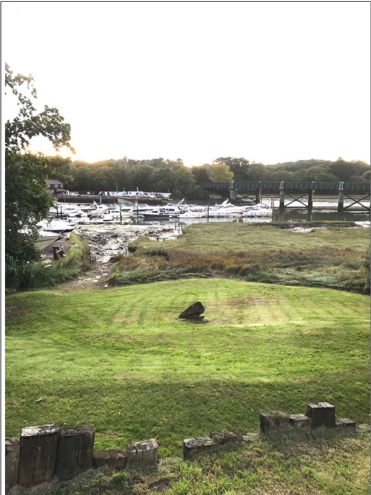
2020 prior to construction of jetty. Hard standing is visible on which jetty was placed