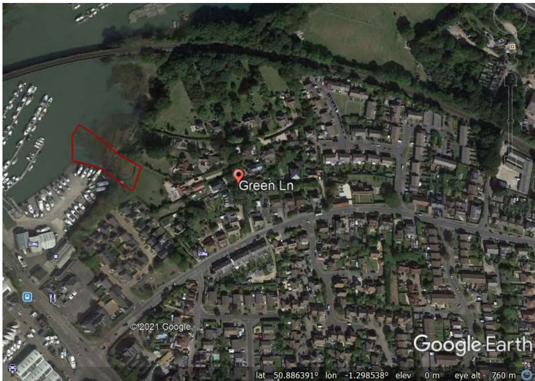
Figure 1. Highfield Survey Site (red) in context with the wider area

Every effort was also made to identify invasive non-native species (INNS) though this assessment does not constitute a full Schedule 9 (as listed under the Wildlife & Countryside Act) species survey. The potential for any Schedule 9 species was assessed and any clearly visible species that were encountered were mapped and noted.