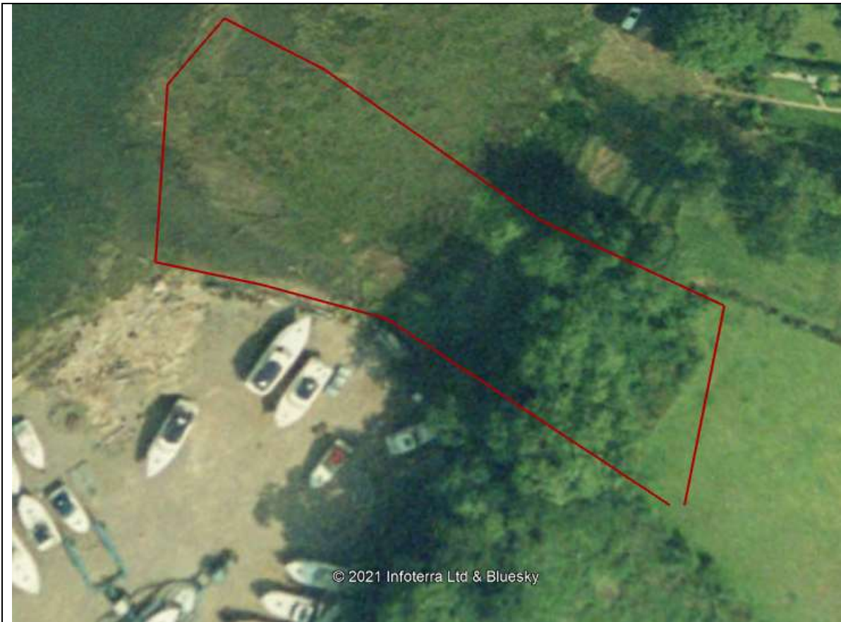
1999: Little or no visible access to the river from the site.